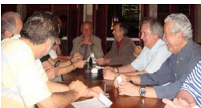
Participants attending the Sensitization Seminars: (above) the seminar in Indonesia in 2007; and (below) in Brazil in 2008.

In 2007, ISA began a new programme of regional sensitization seminars on issues associated with the 1982 United Nations Convention on the Law of the Sea, the work of the Authority and on marine mineral resources. The first seminar was held in Manado, Indonesia in conjunction with the Governments of Indonesia. The second seminar took place in Rio de