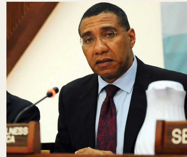
Most Honourable Andrew Holness, Prime Minister of Jamaica