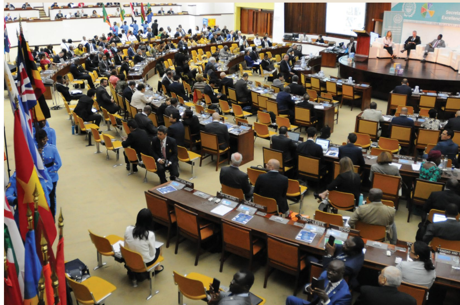
A commemorative meeting was held on 25 July 2019 during the 25 th session

On 25 July 2019, ISA held an all-day commemorative session. Key events included the second edition of the Secretary-General's Award for Excellence in Deep Sea Research, a high-level panel on capacity-building, a special commemorative session of the Assembly and the launch of the DeepData platform.