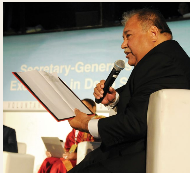
H.E. Honourable Baron Waqa, President of Nauru, co-chairs the high level panel

The Secretary-General highlighted on this occasion the contractor training programme as well as the Abyssal Initiative and ADSR projects, both designed to address the capacity-building needs of developing States.