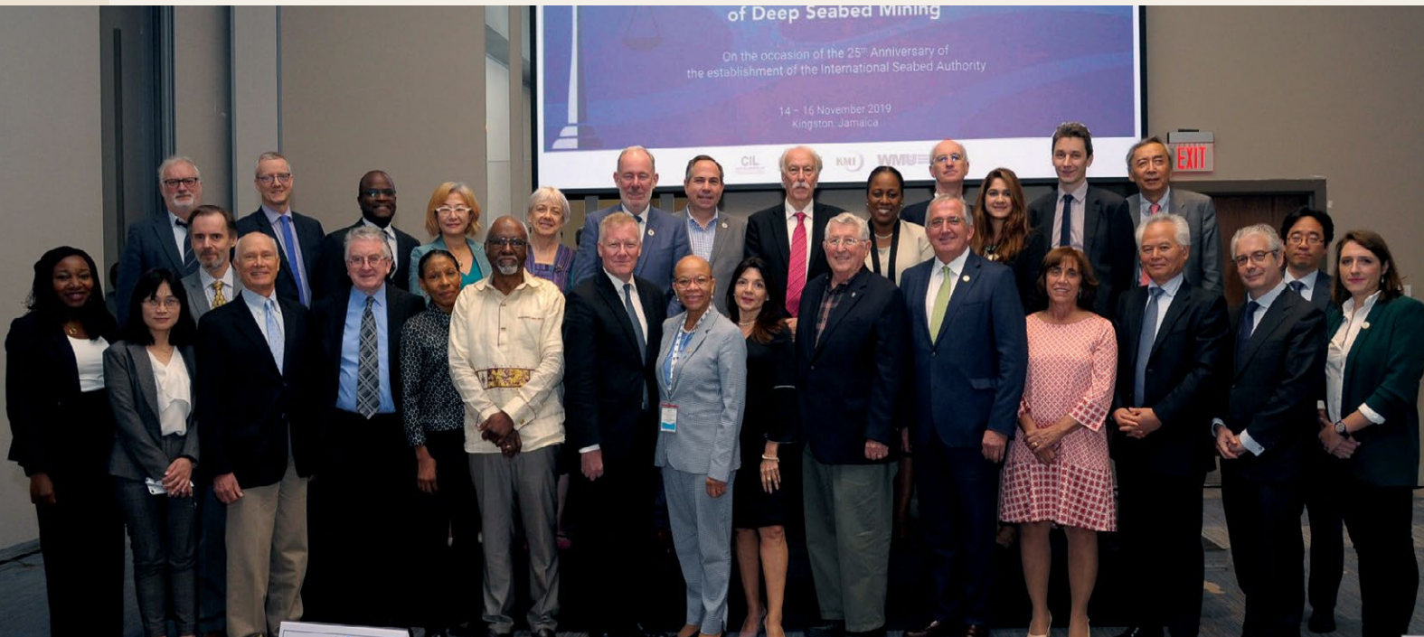
ISA organized the conference together with COLP and thanks to the generous support of CIL, ICAS, KMI and WMU.

The conference brought together over 100 participants, including high-level government officials, international experts, researchers and scholars from the legal and scientific community, along with representatives of the diplomatic corps, to celebrate this milestone and to discuss the many achievements realized within 25 years as well as the future of deep-sea mining.