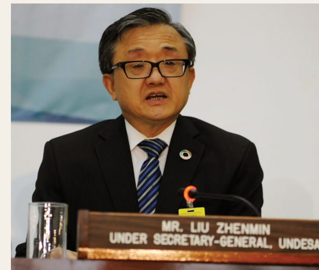
Mr. Liu Zhenmin, Under-Secretary-General for Economic and Social Affairs and Secretary-General for the United Nations Oceans Conference