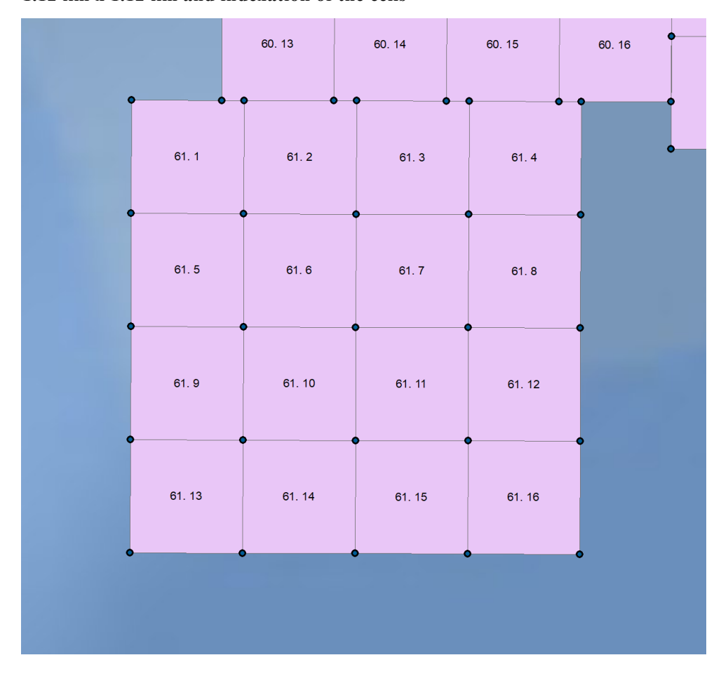
Figure 2 Subdivision of a cobalt-rich ferromanganese crust block into 16 equal cells of 1.12 km x 1.12 km and indexation of the cells

12. Blocks with sides that are not an integer number of kilometres should be subdivided in such a manner that the dimensions of the cell sides are approximately 1 km. For cobalt-rich ferromanganese crusts, where the initial block size is 20 km<sup>2</sup>, many blocks of approximately 4.5 km x 4.5 km have been created, applying the principle laid out in paragraph 8 above. In such cases, the initial blocks will be subdivided into 16 cells of approximately 1.12 km x 1.12 km each, as shown in figure 2 below.