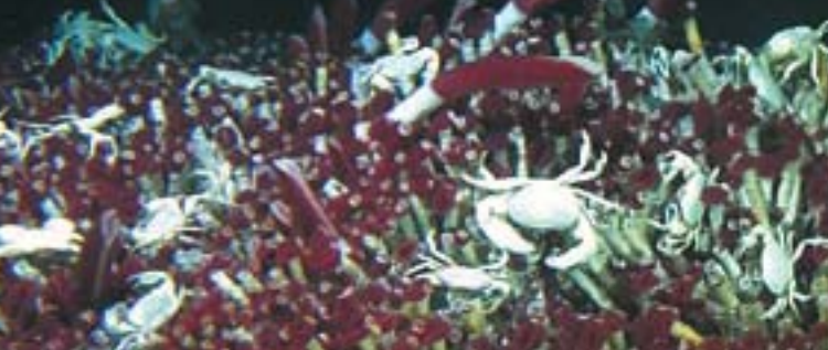
hot springs ecosystem

In addition to concentrating metals, the seafloor hot springs provide the chemicals used by microbes to generate energy at the base of a food chain that supports an ecosystem of newly discovered animal species living amidst the mineral deposits. This ecosystem has scientific and commercial value in terms of its role in sustaining biodiversity, elucidating the early evolution of life, and producing novel organic compounds useful in industrial and pharmaceutical applications. The coincidence of non-living and living resources poses the challenge to develop a regime that allows sustainable development of both resources while protecting the ecosystems.