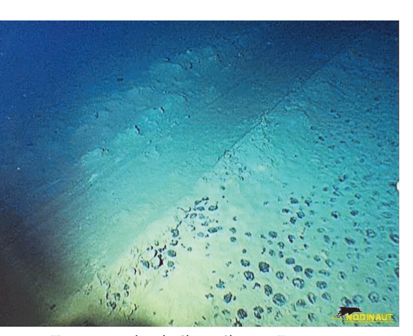
Test mining track in the Clarion-Clipperton Zone

This was the only recommendation not agreed to by all workshop participants.