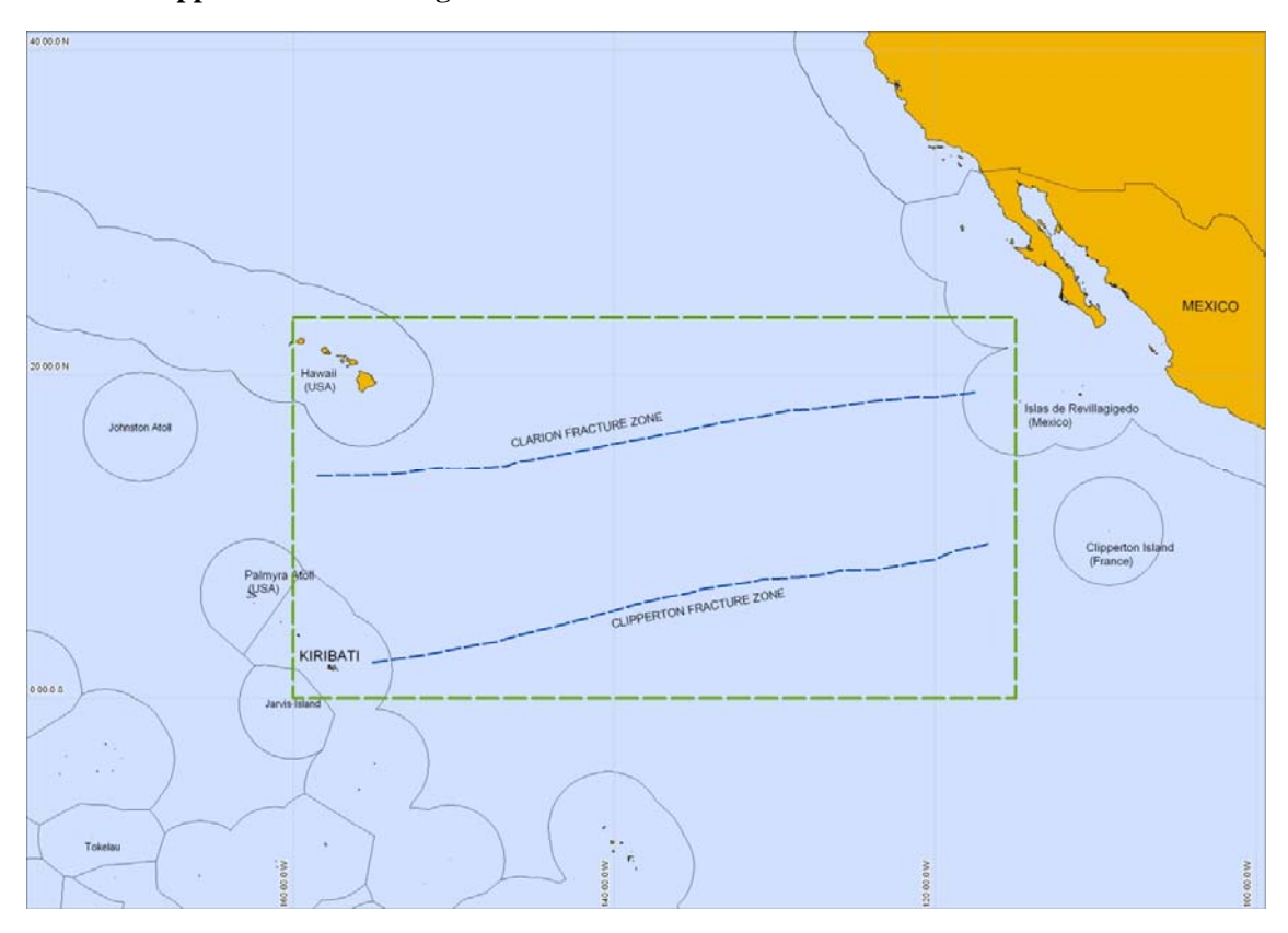
Figure I Clarion-Clipperton Zone management area