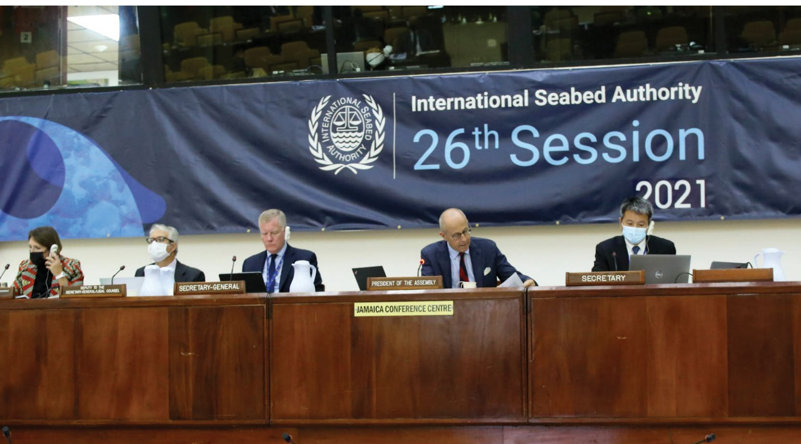
Ambassador Denys Wibaux of France was elected as the President of the 26th session of the Assembly