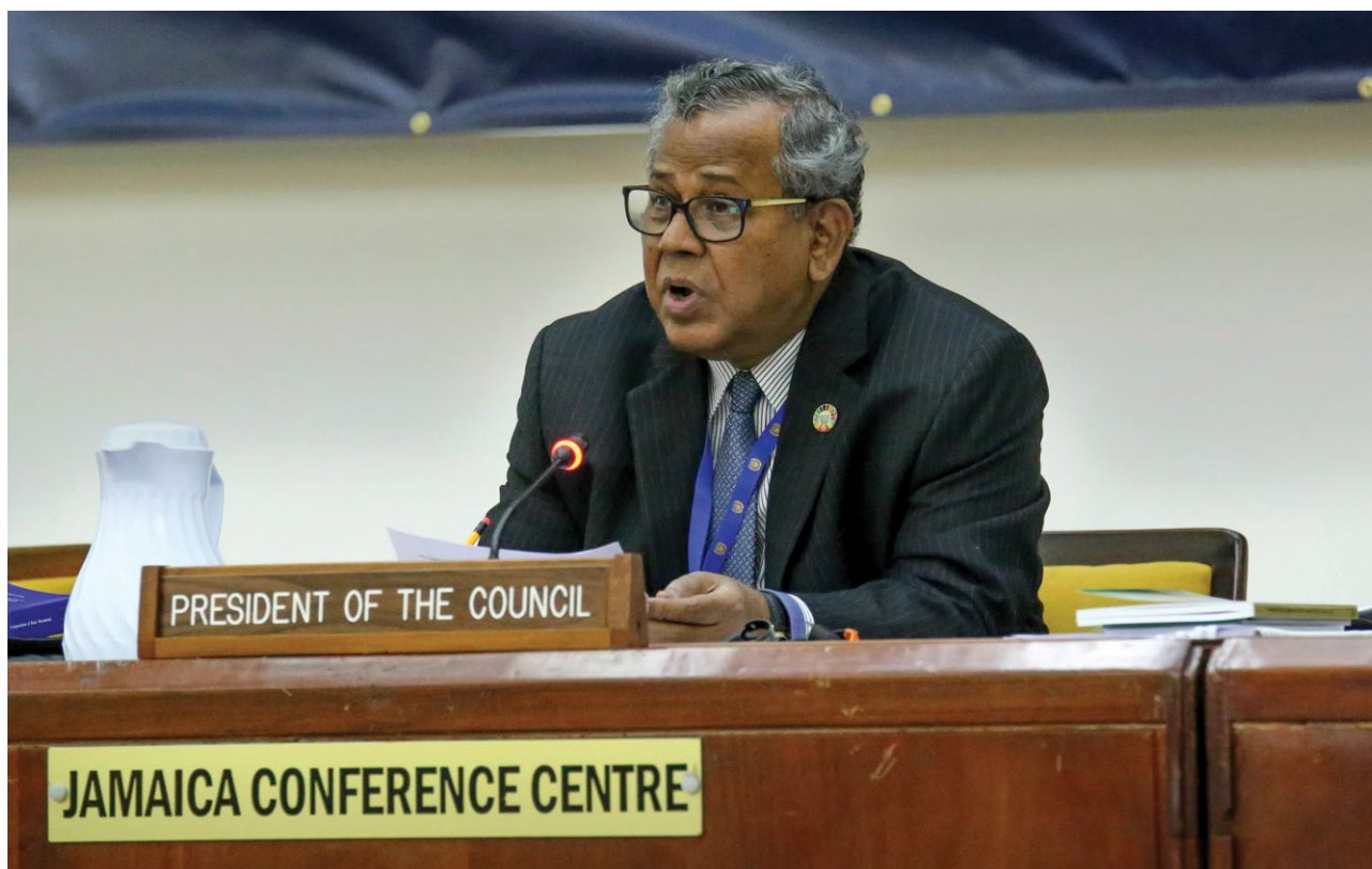
Rear Admiral (Retd.) Md. Khurshed Alam of Bangladesh presided over meetings of the 26th session of the Council

Finally, the Council continued to consider the issue of the size and composition of the LTC, an issue that has been on its agenda since 2016, and decided to resume the discussion at its next meetings.