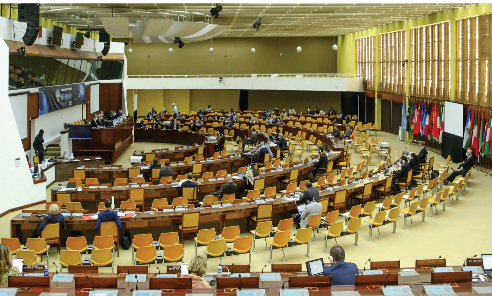
The Council of ISA met at the Jamaica Conference Centre from 21 March to 1 April 2022

The Council also considered the report of the Special Representative of the Secretary-General for the Enterprise.