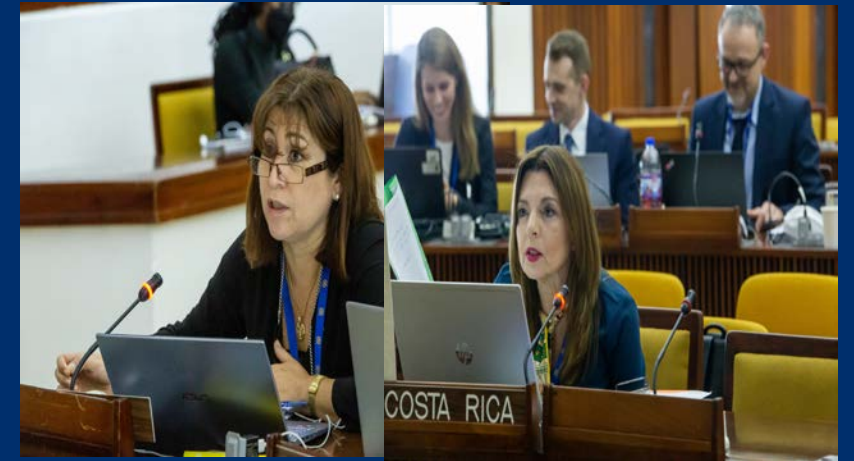
Facilitators for the IWG on Institutional Matters