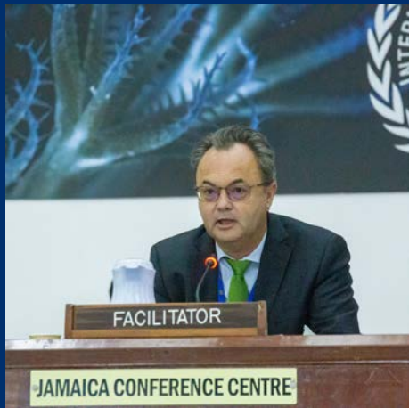
Facilitator of the OEWG for Financial model