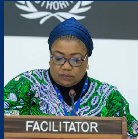
Facilitator for the IWG on Inspection Compliance and Enforcement