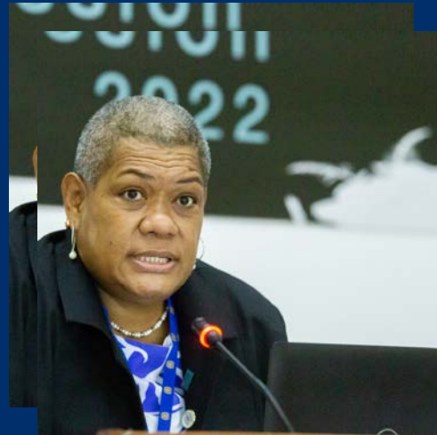
Facilitator for the IWG on the Environment