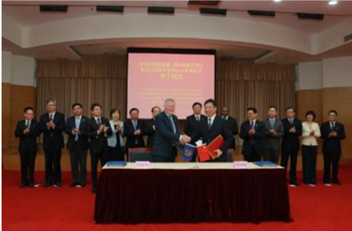
MoU Signing Ceremony in Beijing.