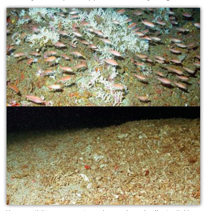
Human activity on seamounts can be very damaging if not suitably regulated.

The recommended format for the EIS is outlined below. It is intended to provide the Authority and other stakeholders with unambiguous documentation of potential environmental impacts on which the Authority can base its assessment and any subsequent approval that may be granted.