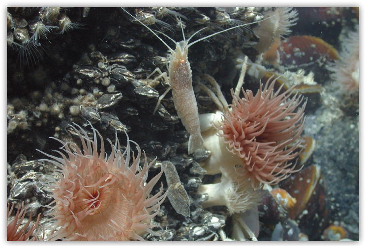
Fauna on an undisturbed hydrothermal vent

Confidential information: Details of classified information relating to a manufacturing or industrial process or trade secret used in carrying on or operating any particular undertaking or equipment or information of a business or financial nature in relation to the proposed activity should be clearly defined. Such information would be classified as "confidential information" and excluded from the EIS before the document is made available for public review.