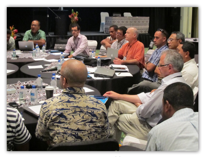
Working group discussions during the 2011 workshop

The Fiji workshop was convened to follow up on the increasing interest in and associated concerns about the potential impacts of deep sea minerals exploration and mining and how responsible authorities will regulate this emerging economic development opportunity in a sustainable manner, both within national jurisdiction and in the Area. The workshop was attended by 79 participants from 18 countries, and was supported by the secretariat of the International Seabed Authority and the SPC. The full list of participants can be found in the Annex to this document.