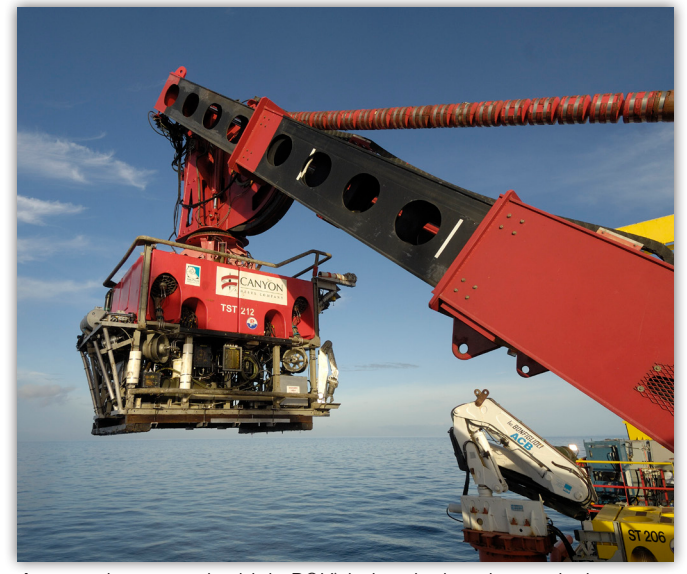
A remotely operated vehicle ROV) being deployed to study the seafloor.

These various provisions of the Convention and the Agreement have been given substance through Regulations progressively issued by the Authority governing activities in relation to specific mineral resources. The first set of Regulations, adopted in 2000, dealt with polymetallic nodules. The second set of Regulations, adopted in 2010, govern prospecting and exploration for polymetallic sulphides. It is anticipated that Regulations for prospecting and exploration for cobalt-rich ferromanganese crusts will be adopted in 2012.