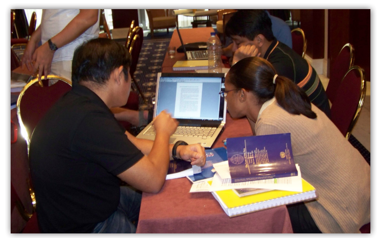
Training being received as a result of funding being provided by the ISA Endowment Fund.

A dual EIA system (assessment) is supported where PICs concentrate on country-specific impacts, and outsource technical DSM-specific activities to external providers, with a preference for a strengthened regional body be mandated to perform this role. The advantages of such a system include improving national EIA-related skills without having to allocate scarce resources to developing DSM-specific skills for a one-off application or where a low number of applications will be received over many years. Further, this proposed model will address the ongoing issue of high professional turn over within the government system due to brain drain to the commercial sector and migration. Any outsourcing of technical assessment and advice falls with the competency of individual PICs who would retain sovereignty in all matters.