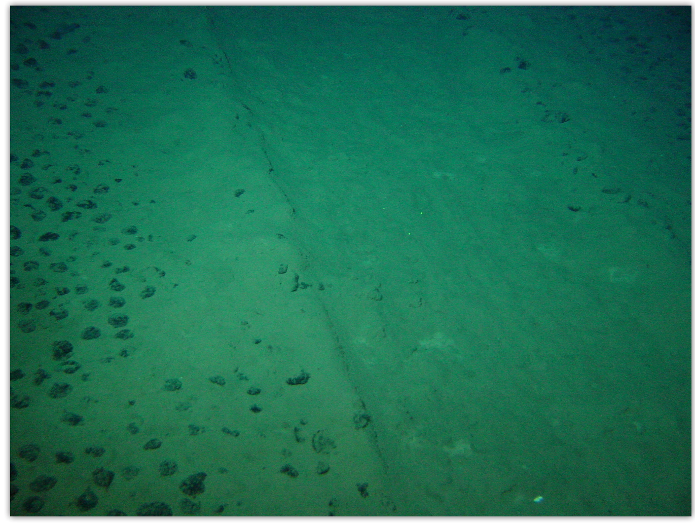
An example of the localized impact created by a nodule mining collecting system.

The Working Group agreed that powers, duties and functions under the Act should be consistent with UNCLOS. An example of wholesale incorporation into domestic legislation was noted in New Zealand's EEZ and Continental Shelf (Environmental Effects) Bill; clause 11 of this Bill states that: "This Act must be interpreted, and all persons performing functions and duties or exercising powers under it must act, consistently with New Zealand's international obligations under the LOSC."