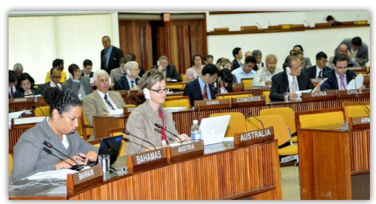
The International Seabed Authority during its annual session

There are a number of methods of allocating sites for mining exploration, e.g. on a first-come first-serve basis, or through an auction/bidding process. The mechanism of allocation needs to be provided for in the Act. Allocation systems should enable investment by mining companies and facilitate competition. For example, they should provide for certainty of process, and prevent consideration of extraneous matters, such as trade competition effects.