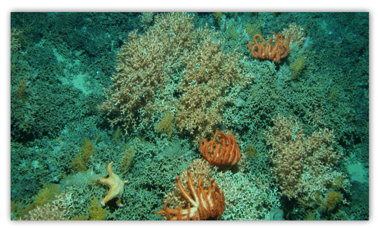
Fauna on an undisturbed seamount

In addition, a mandate could be given by PIC leaders to support the concept. This will require input from PICs in terms of what their needs and priorities are and options could be developed to address them.