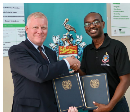
Five Islands Campus, University of the West Indies, Antigua and Barbuda