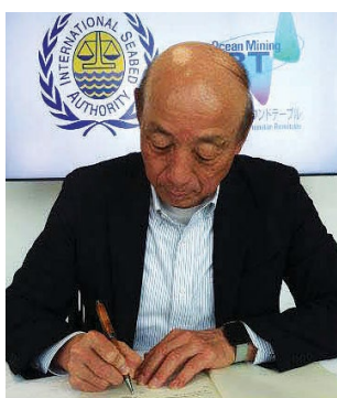
Ocean Mining Roundtable